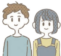
University students and graduate students

I'll be happy if you can feel free to talk even about things that you'd normally be uncomfortable sharing with an adult.