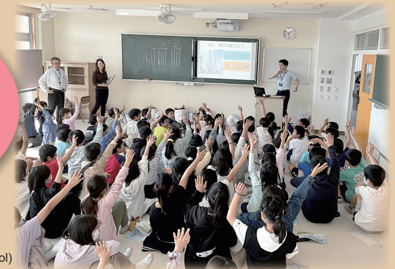
Status of classes (Chofu Municipal Fuda Elementary School)

The staff members of the Tokyo Metropolitan Government will visit elementary schools to provide lectures on various themes.