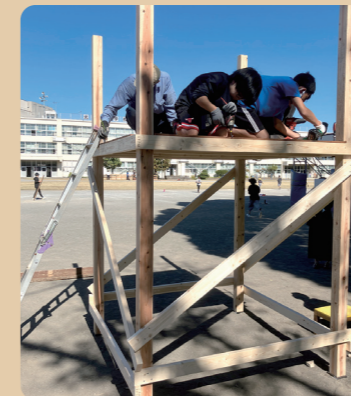
Production of the slide based on children’s ideas.

We will create playgrounds where children can realize “what they want to try”.