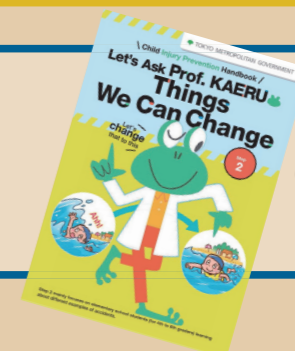
Child Injury Prevention Handbook.

Let's think about prevention of accidents together.