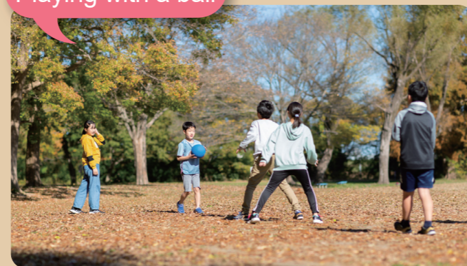
Playing with a ball