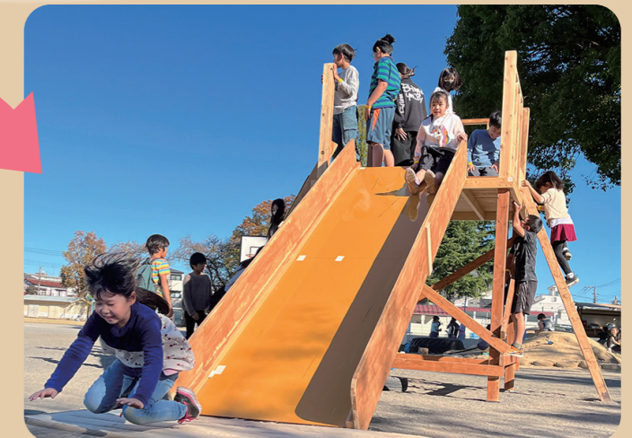
Completion of the slide.

We will convey the importance of play for children to everyone.